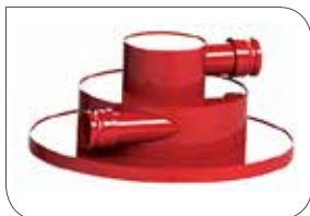
Drum pre-separator assembly