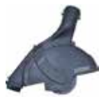
Dust hood for 4"-5" grinders