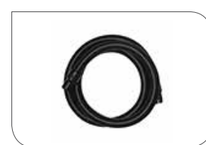
Hose 10 x 1.5 crush proof