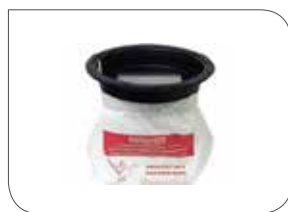
HEPA filter 16"