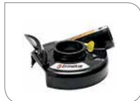
7" Dust Shroud