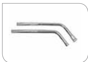
Metal wand, 5" two-piece