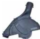
Dust hood for 7"-9" grinders