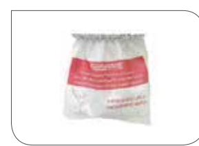
Dacron "never clog" filter bag