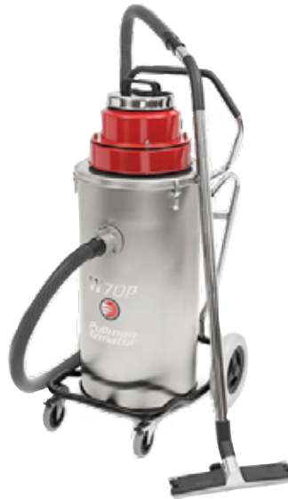
*Includes 1.5", 10' hose, 3 piece wand and floor tool.