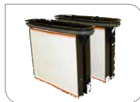
HEPA filter, 2/set