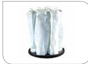
Filter Stock Assembly