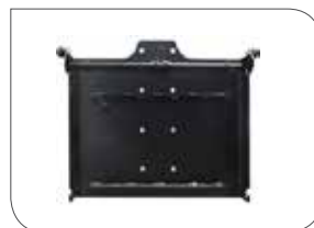
Trailer, Large Vac (T10000)