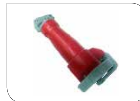
Plug-to-power, 60 AMP