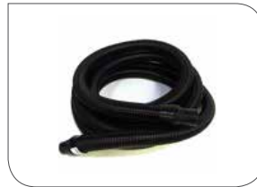
2" Hose Assembly