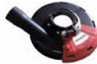
Standard 5" dust shroud