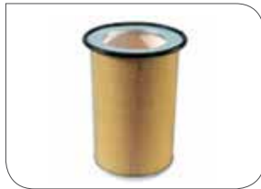
HEPA Filter T-Line