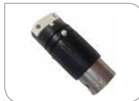
Plug-to-grinder, 50 AMP