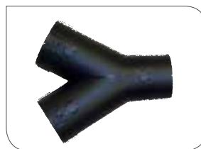
Y connection set. 1.4"-2x1.4"