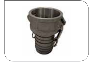
Camlock 3" Aluminum