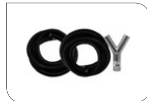
Hose kit, deluxe twin