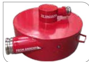
Deluxe drum pre-separator assembly