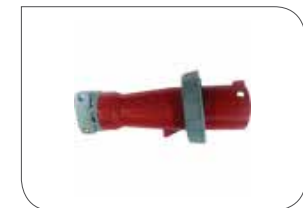
Plug-to-grinder, 60 AMP