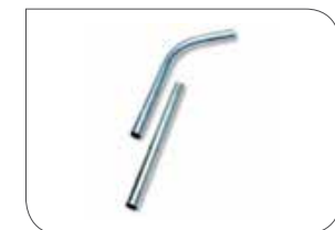
Wand Tool, 2-part