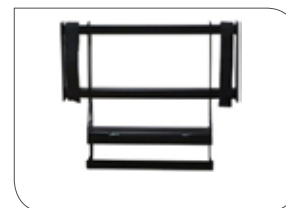
Trailer, Large Vac (T 8600 & T 7500)