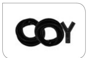
Hose kit, standard twin