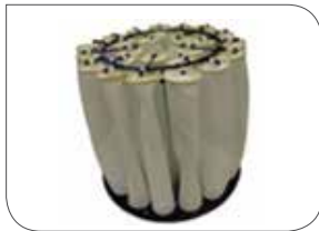
Main Filter Stock