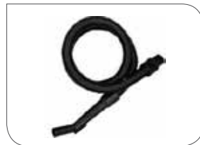
Hose assembly, 1.25" x 6"