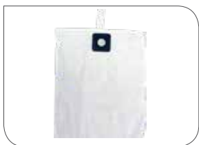
Bag, high filtration