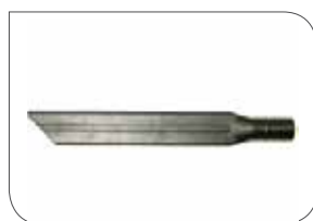
Crevice tool 17"