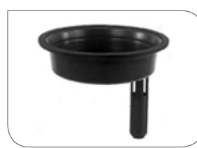
Wet pick up adaptor