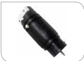
Plug-to-power, 50 AMP