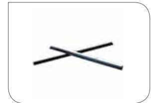
Blade Set 18"