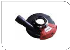
5" Dust Shroud Kit