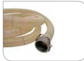
3" Hose Assembly